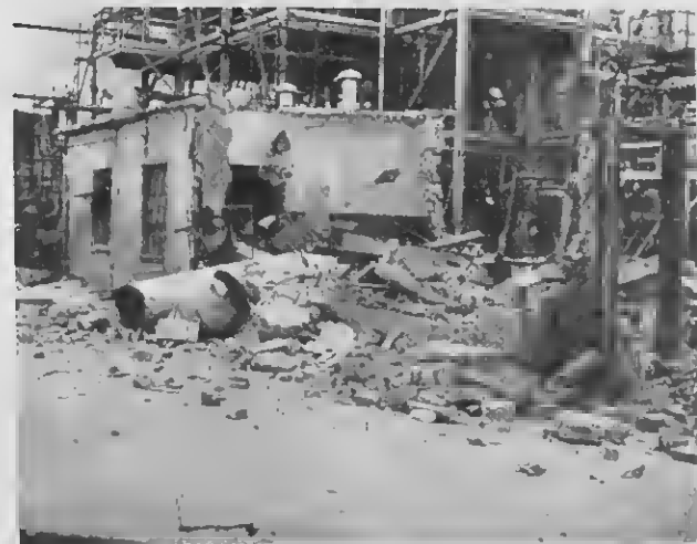
THE OLD control house was busted up in short order. These two views show the demise of the old low octane S & S control house.